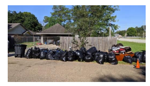
Things scattered around